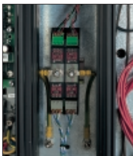
Two ESP 15H protectors mounted in a control cabinet and earthed via the cabinets' earthed chassis.

For some data and signal applications with lower current, higher in line resistance or higher bandwidth requirements, the D or E Series protectors may be more suitable. If the protector is to be mounted directly onto a PCB, use the ESP PCB/**D or ESP PCB/**E protectors.