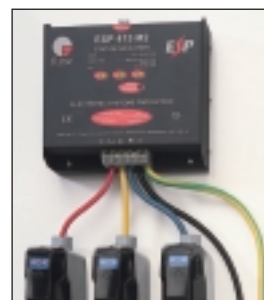
Live connecting leads should be fused on supplies exceeding 200A (ESP 415 M2) and 315A (ESP 415 M4).

Connect, with very short connecting leads, to phase(s), neutral and earth. Phase/live connecting leads should be fused with high rupture capacity (HRC) fuses, a switchfuse, MCCB or type 'C' MCB.