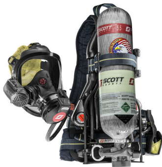
AIR-PAK X3 SCBA