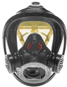
AV-3000 HT FACEPIECE