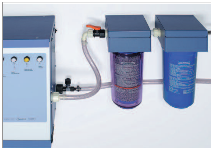
Aquatron® connected in series with deioniser and filter