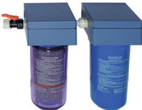
Deioniser and filter connected via ALC and fitted with wall mounting brackets