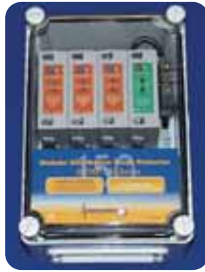
Pictured - MDSP3/150

This three phase DIN rail mounted modular surge protector comprises three 90kA Line/Neutral MOV modules and one 150kA Neutral/Earth MOV module all of which are housed in a high impact plastic enclosure with clear cover. All modules have dual thermal and current overload fusing and are so arranged as to provide a redundancy feature should one of the discs be damaged due to excessive energy. Status indication of the modules is by lights and the Neutral/Earth module provides indication of high neutral to earth voltages. All modules have a remote indication facility.