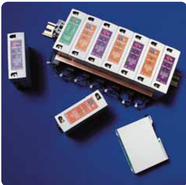
Silicon Avalanche Diode (SAD) and Metal Oxide Varistor (MOV) replaceable DIN rail mountable modules for MDSP3-90, 150 and 300 series

The MDSP should be installed as close as possible to the supply cables being protected, with as large a conductor as possible (35mm 2 max). The connecting wires should be routed, avoiding looping, and secured together with ties. See installation data sheet instructions. The Modular Distribution Surge Protector must be connected in parallel to supply via an isolating switch if the mains supply cannot be switched off for module replacement. If RCD's are used the MDSP must be fitted in front of such devices to avoid nuisance tripping. Provision should be made for safe replacement of the MDSP and/or modules should this become necessary.