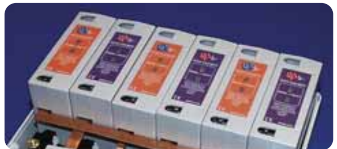
Full status is indicated on each suppression module

The MDSP can be connected to a supply greater than 100A providing inline fuses rated 100A max are fitted. In order to discriminate with the supply fuse the inline fuse should be in the ratio of 1:2. The inline fuses can be replaced by MCBs providing they are type C/D.