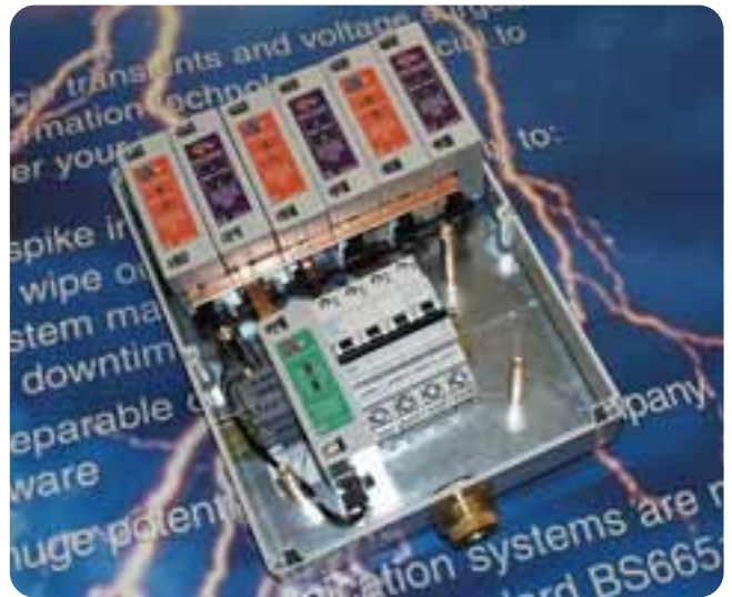
MDSP3/150/12-SAD/MOV model with optional MCB facility