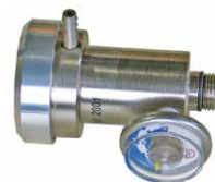
Demand flow regulator