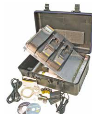
MicroDock II portable system kit