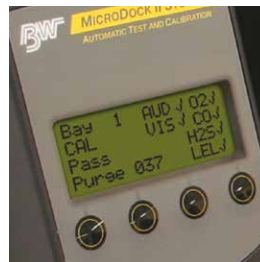
*Available with Honeywell IntelliDoX in 2019