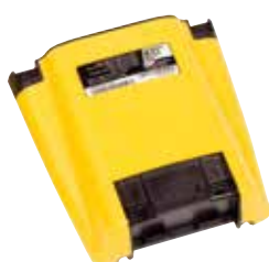
Alkaline Battery Pack M5-BAT0501/M5-BAT0501B M5-BAT0502/M5-BAT0502B

For complete MicroDock II system configuration information, see MicroDock II section.