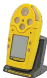
Cradle Charger Kit with Battery M5-C01-BAT08 / M5-C01-BAT08B Complete with charger and rechargeable battery pack