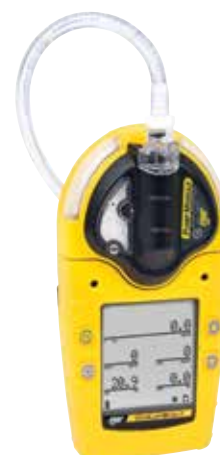
GasAlertMicro 5 Pump version