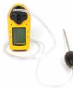
Manual Aspirator Pump GA-AS02 For remote sampling; complete with probe, hose and aspirator pump