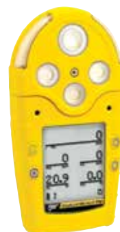
GasAlertMicro 5 PID Diffusion version