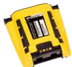
Rechargeable Battery Pack M5-BAT08/M5-BAT08B