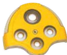
Replacement Diffusion Cover M5-DC-1