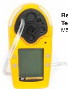
Replacement Test Cap and Hose M5-TC-1

Note: For complete list of Sampling & Testing Equipment, see the Sampling Equipment section.