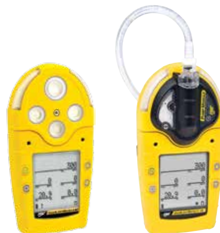
GasAlertMicro 5 IR Diffusion version