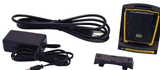
Cradle Charger M5-C01 Cradle charger for rechargeable battery packs (can charge battery pack with or without detector attached)