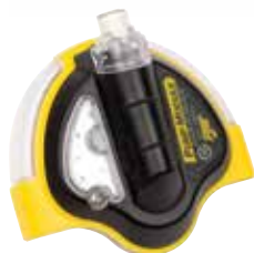
Pump Module M5-PUMP