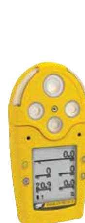
GasAlertMicro 5 Diffusion version