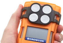
External filter plate Clip-on filter for dusty environments