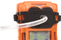
Bump/calibration plate To apply test gas to T4