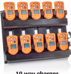
10 way charger For charging and storing your T4 fleet