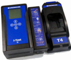
I-Test Easy automated bump testing and calibration solution