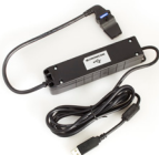
USB communications lead