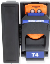
Vehicle charger Effective charging and storage whilst travelling