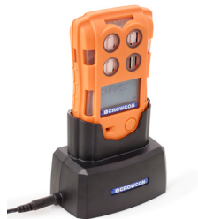
Cradle charger Docking station for easy charging

Crowcon reserves the right to change the design or specification of the product without notice.