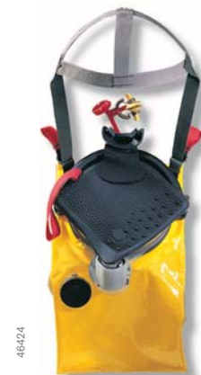
Dräger Oxyboks K 25