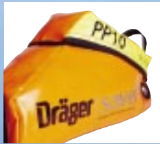
Anti-Static Bag 10mins (order code:- 335 0425) Anti Static Bag 15mins (order code:- 335 0648)