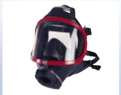
Panorama Nova Face Mask (order code - R59024)