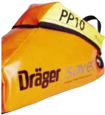
Saver PP10 (order code:- 335 0534) Saver PP10 with DIN cylinder (order code:- 335 0408)