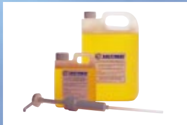
Safety Wash 1 litre Dispenser (order code:- 338 0164) 1 litre Refill (order code:- 338 0165) 5 litre Dispenser (order code:- 338 0166) 5 litre Refill (order code:- 338 0167)