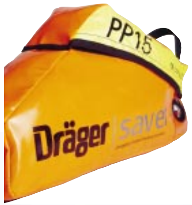
Saver PP15 (order code:- 335 0405)