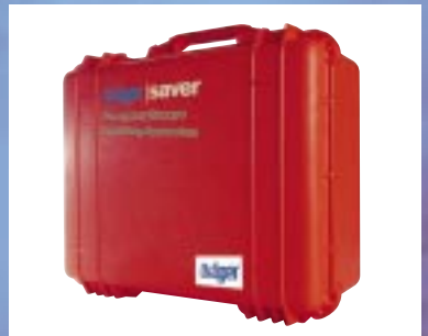
Storage Cabinets (order code:- 335 0424) Wall Mounting Kit (order code:- 335 0431)