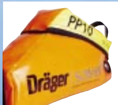
Anti-Static Bag 10mins (order code:- 335 0425) Anti Static Bag 15mins (order code:- 335 0648)