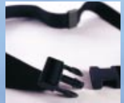
Waistbelt (order code:- 335 0596)