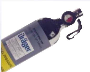
10 Minutes Spare Cylinder with blank (order code:- 335 0148) 10 Minutes Spare Cylinder with blank (DIN) (order code:- 335 0409) 15 Minutes Spare Cylinder with blank (order code:- 335 0156)