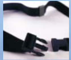
Waistbelt (order code:- 335 0596)