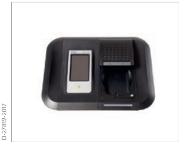
Dräger X-dock® module