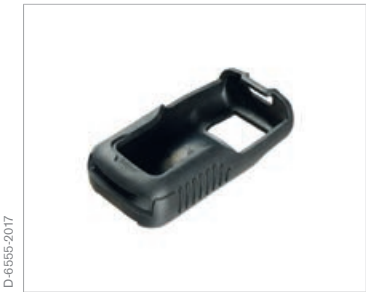
Protective rubber boot