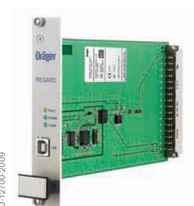
Dräger REGARD interface card