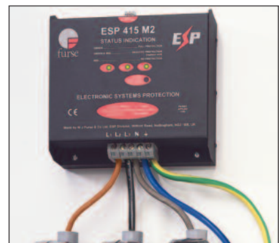
Live connecting leads should be fused accordingly

Install in parallel, within the power distribution board, either on the load side of the incoming isolator, or on the closest outgoing way to the incoming supply.