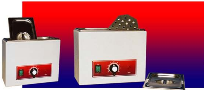
9 litre Bath WBH9