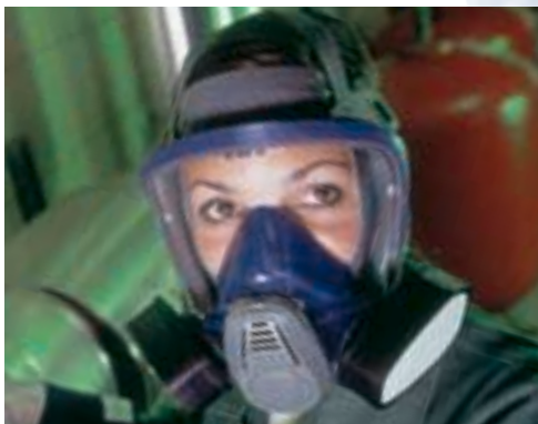
Advantage 3200 with TabTec® Gas Filter

Clean air for breathing is essential for life. So nothing is more important than clean air – especially if you have to work in a contaminated atmosphere.