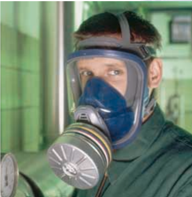
Advantage 3100 with Gas Filter ABEK

With the Advantage 3000 and Advantage 200 LS masks, as well as the TabTec® Filter Technology, MSA has introduced three different respiratory protection devices on the market and established a technology lead.