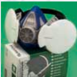
Particle, Gas and Combination Filters for the Advantage 200 LS

For storage and transport of the mask, the Advantage belt pouch provides a perfect solution.