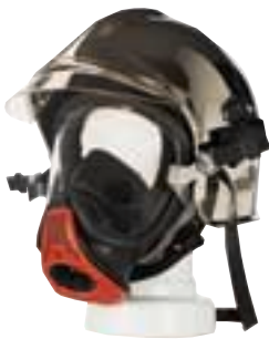
Ultra Elite H-PF-F1 [with MSA GALLET helmet]