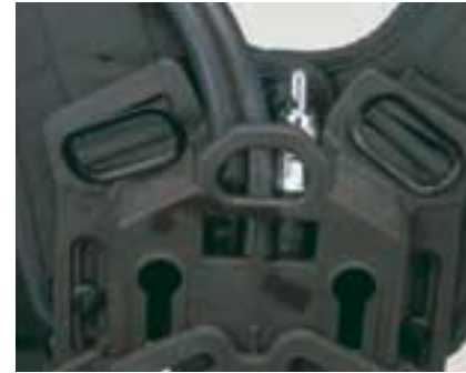
AirMaXX® S Retreat signal near the ear [For noisy applications]

MSA AirMaXX®, safety today and in the future!