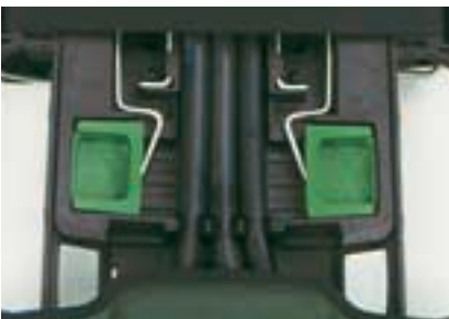
AirMaXX® carrying plate The triple length adjustment assures comfortable wearing [Utmost flexibility]