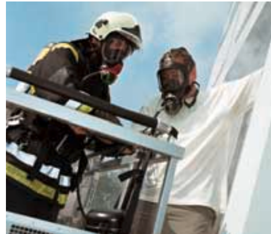
Rescue Set in Action