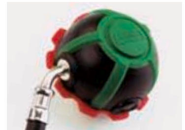
AutoMaXX®-AE Standard high pressure connector with M 45 x 3 thread according to EN 148-3 [Updated classic]

Maximum freedom of movement since the connections to facepiece and medium pressure line swivel. The silicone line remains flexible also at lowest temperatures. The semiglobe shaped housing is handy and the coloured operating buttons can be pushed easily also with gloves. The lung governed demand valve is easily activated with the first breath and operates very quietly. A lung governed demand valve of the luxury class!