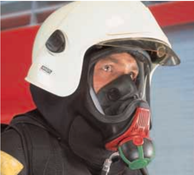
Ultra Elite-PF with AutoMaXX-AS [Highest Comfort]