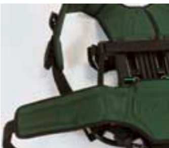
AirMaXX® harness Hip belt and shoulder pads assure pleasant wearing and optimal fit [Simply comfortable]

One for all: The MSA AirMaXX® has a carrying plate with triple length adjustment.