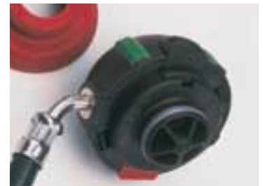
AutoMaXX®-AS Positive pressure lung governed demand valve with MSA plug connector [Fully automatic air supply]