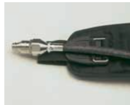
AirMaXX® Q The Quick-Fill connection permits charging the cylinders with the apparatus donned [Filling of air in 45 sec]