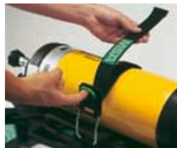
AirMaXX® cylinder retainer Exceptionally simple and quick cylinder change [Simply quick]

Changing the cylinders is no problem: patented slide studs make changing simple and easy. On closing the cylinder strap buckle, the slide studs are pressed down and the cylinder is secured absolutely safe in position. With the handy bracket the length of the strap is quickly extended. Thus, cylinders of different size are quickly exchanged!