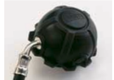
AutoMaXX®-N Normal pressure lung governed demand valve according to EN 148-1 [Cutting – edge tradition]

The large operating buttons are positioned where you expect them. The housing is designed that it cannot get caught and that blows are deflected. The protective cap assures highest operating safety: even in case of damage, the AutoMaXX continues to function.