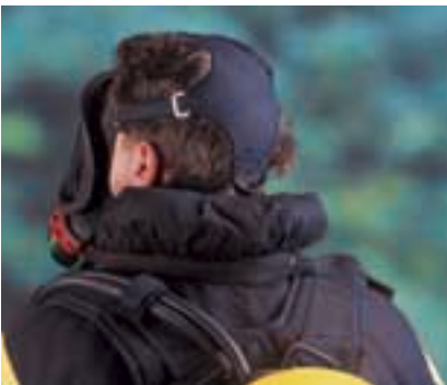
Ultra Elite-PF-EZ with Easy-don Nomex harness. Also for the 3S full face mask series. [Perfect fit]