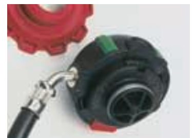
AutoMaXX®-AS-C: Combines the standard M 45 x 3 thread with the handy plug connector [Crossing generations]