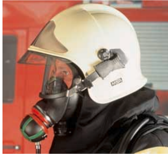
3S-H-PS-MaXX-P with AutoMaXX®-AS [Tradition & future combined]

As well for the 3S full face mask series there is a wide range of accessories. Please refer to our leaflet ID 05-405.2 ITL.