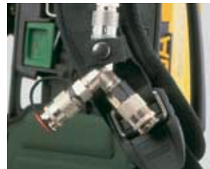
AirMaXX® Z The universal Second Connection for rescue applications [Safety for two]