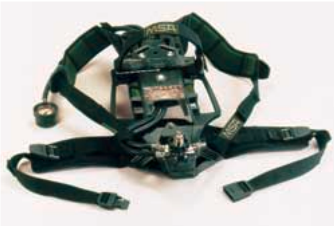
AirMaXX® basic apparatus [Comfort is standard]