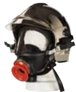
3S-H-PS-MaXX F1 [with MSA GALLET helmet]

Special adjustable rubber straps allow attaching the mask to the helmet quickly and securely, without need to take off the helmet. Similarly, the mask can be comfortably detached from the helmet if there is no longer a need for respiratory protection during work. Please refer to our leaflet ID 05-432.1 ITL.