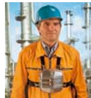
SSR 30/100 B