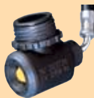
LA 88-N D4075960