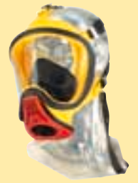
Ultra Elite-PF-Silicone D2056763