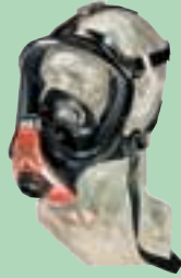
Ultra Elite-PS w. transponder 10026552