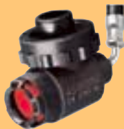
LA 88-AS D4075906