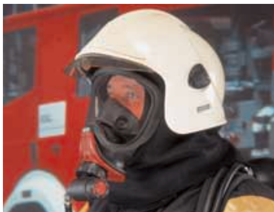
Masks for Mask- Helmet-Combinations Lung Governed Demand Valves [MSA GALLET]