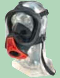
Ultra Elite-PF-EZ D2056771