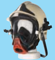
Ultra Elite-H-PF-F1 10045893