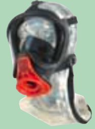
Ultra Elite-PS-MaXX-EZ 10031382