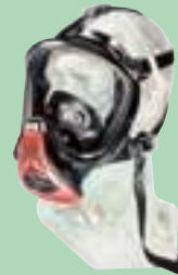
Ultra Elite-PF D2056741

Full face masks for two-way breathing with spring loaded exhalation valve. For compressed air breathing apparatus with suitable positive pressure lung governed demand valve.