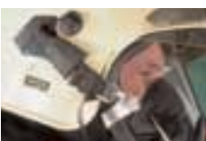
Exclusive MSA Adapters for Mask-Helmet- Combinations