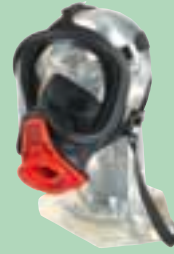
Ultra Elite-PS-MaXX 10031385

Full face masks for two-way breathing with spring loaded exhalation valve. For compressed air breathing apparatus with AutoMaXX-AS positive pressure demand valve.