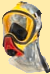
Ultra Elite-PS-Silicone D2056764