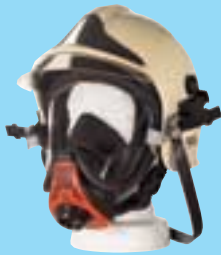
Ultra Elite-H-PS-F1 10045897