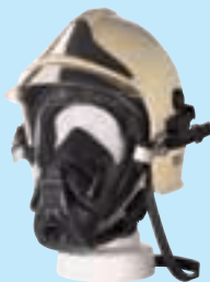
Ultra Elite-H-F1 10045891