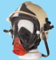
Ultra Elite-H-PS-MaXX-F1 10045899