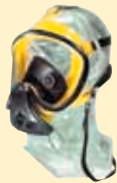
Ultra Elite-Silicone D2056718