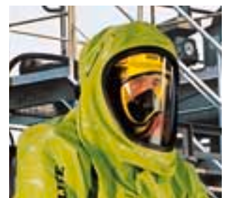
Perfect inside total encapsulating suits due to ergonomic design