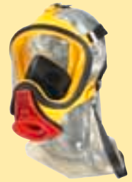
Ultra Elite-PS-MaXX-Silicone 10031384