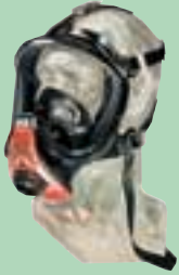
Ultra Elite-PS D2056751

Full face masks for two-way breathing with MSA Plug connector. For compressed air breathing apparatus with suitable positive pressure lung governed demand valve.