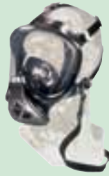
Ultra Elite w. transponder 10013876