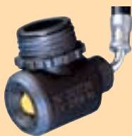
LA 96-N D4075852