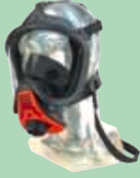
Ultra Elite-PS-EZ D2056772