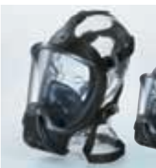
Available in standard and small sizes