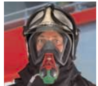
Lens with plane design for an excellent field of vision