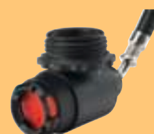
LA 96-AE D4075851