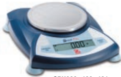
SPU202, 402, 401