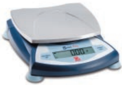
SPU601, 2001, 4001, 6000