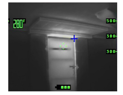
See the Heat Hot spot tracker shows high-risk areas in the floor or ceiling and pinpoints the seat of the fire.