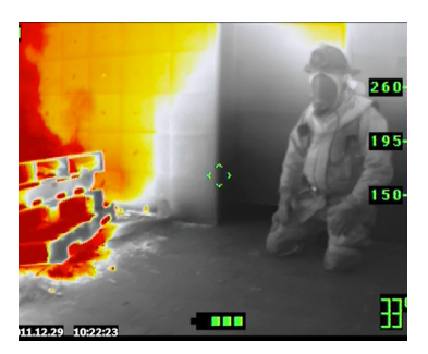
Focus on the Fire Intelligent Focus™ capability shows objects in crystal-clear detail, even at temps above 1000°C.