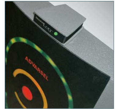
SoundLog consists of a new version of SoundEar®2000 with a built in log function.

By describing the sound level for up to four weeks at a time, and thereby exposing repeated periods of increased noise strain, SoundLog is an important tool for improving overall well being within the working environment.