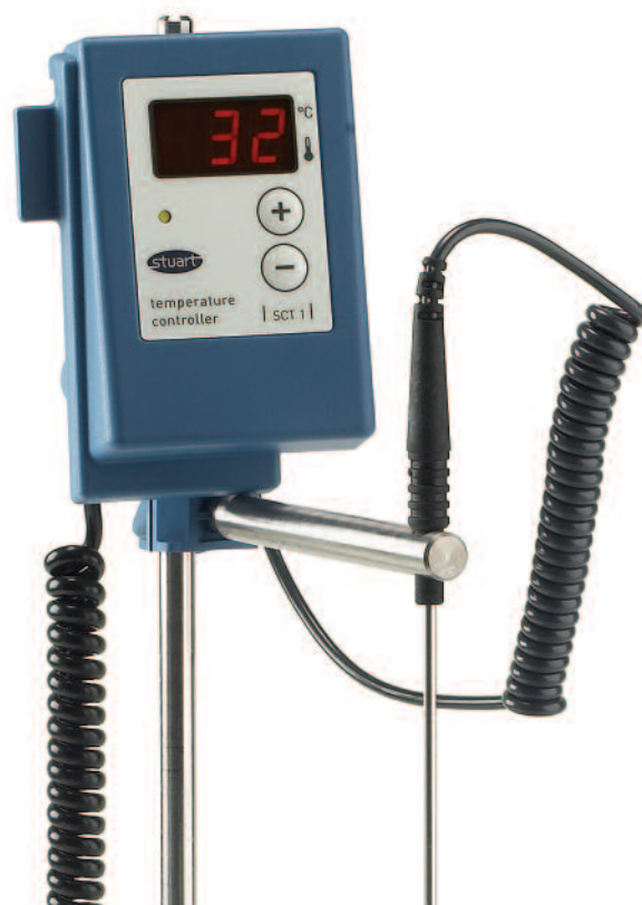
SCT1 with SCT1/1 Probe Holder

NB: the SCT1 can only be used with the SC162 and CC162. It is not compatible with any other Stuart® hotplate stirrer