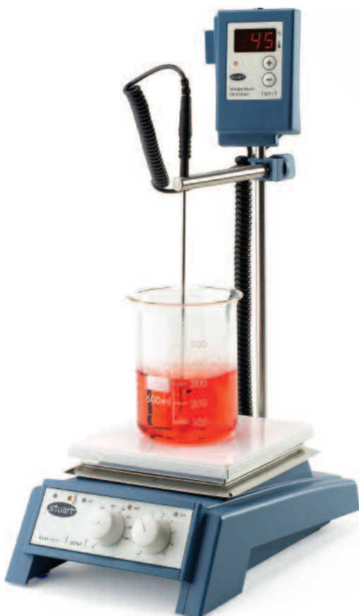
CC162 with SCT1 and SCT1/1