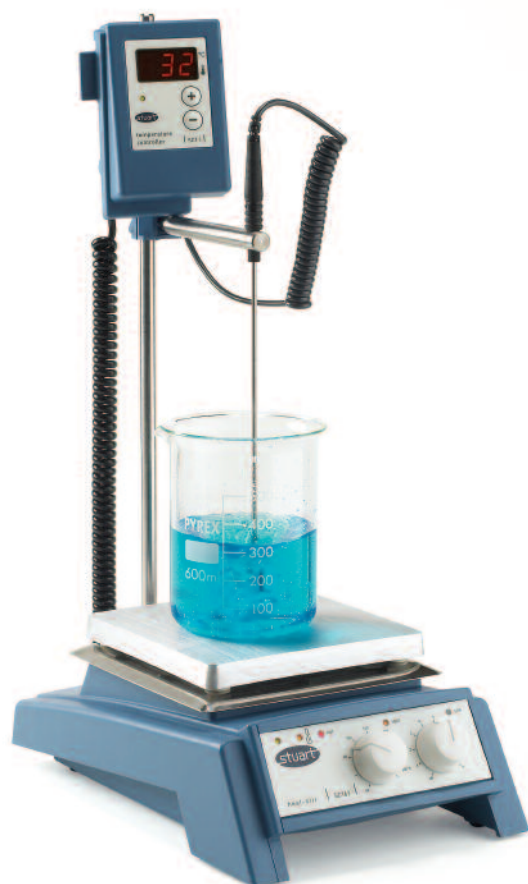
SC162 with SCT1 and SCT1/1