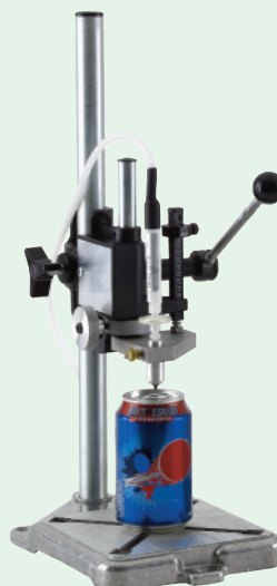
Can Piercing Station

The can piercing station is perfect for rigid packaging and has proven to be stable and reliable in hundreds of demanding applications.