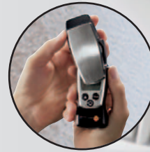
Attachable protective cap