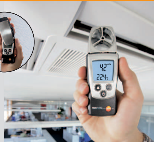
Flow measurement at a duct outlet with 40 mm vane