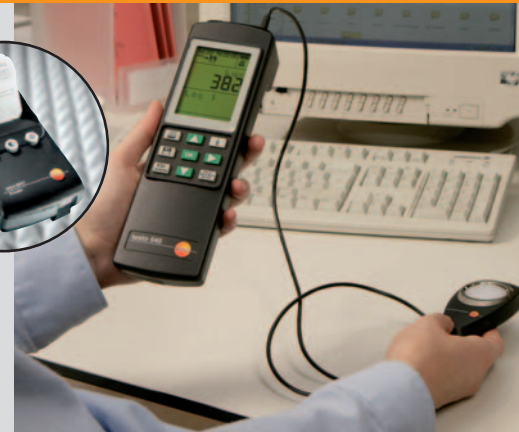
Measures light intensity in the workplace