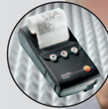
Data is printed on site on the Testo printer (optional)