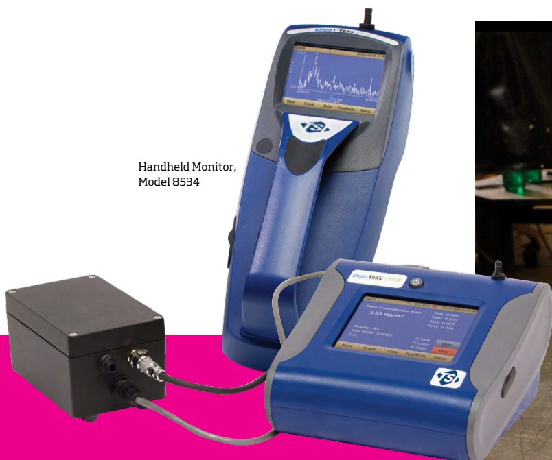
Desktop Monitor with External Pump, Model 8533EP