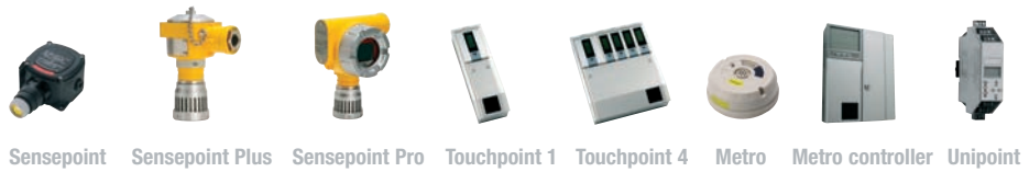
Sensepoint Sensepoint Plus Sensepoint Pro Touchpoint 1 Touchpoint 4 Metro Metro controller Unipoint

Sieger's robust fixed detection is crucial for gas monitoring in extreme conditions