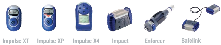
Impulse XT Impulse XP Impulse X4 Impact Enforcer Safelink

MDA Scientific is the leading fixed solution for the semiconductor industry