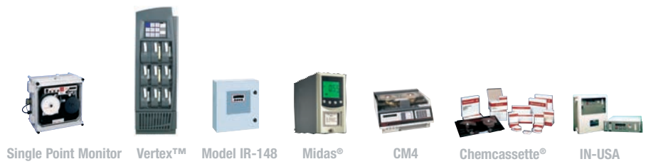
Single Point Monitor Vertex™ Model IR-148 Midas® CM4 Chemcassette® IN-USA

MDA Scientific is the leading fixed solution for the semiconductor industry