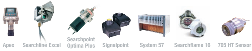
Apex Searchline Excel Searchpoint Optima Plus Signalpoint System 57 Searchflame 16 705 HT Sensor

Neotronics is the tough, portable range of gas detectors