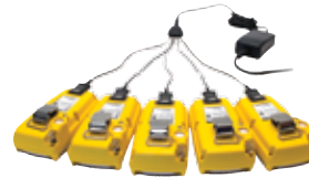
Multi-Unit Power Adaptor GA-PA-1-MC5 Simultaneously charge 5 detectors