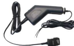
Direct-Wire Power Adaptor 12-24 V DC GA-PA-3 Used for emergency vehicles and other applications