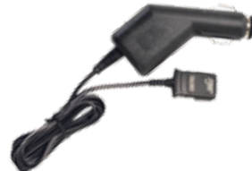
Vehicle Power Adaptor 12-24 V DC GA-VPA-1