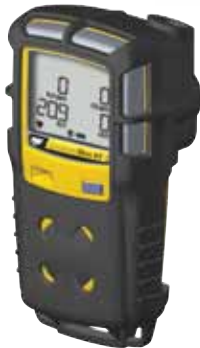
Concussion-Proof Boot GA-BXT