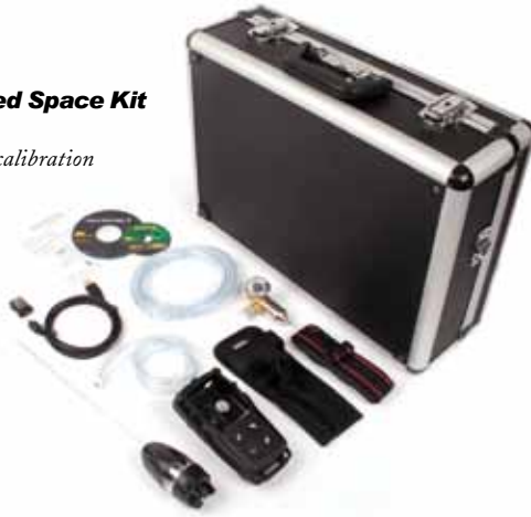
Deluxe Confined Space Kit XT-CK-DL Order detector and calibration gas separately