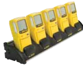
Multi-Unit Cradle Charger XT-C01-MC5 Simultaneously charge 5 detectors