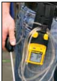
Carrying Holster GA-HXT Sampling Probe GA-PROB1-1