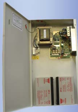
Auxilliary Power Unit provides extended back-up in the event of mains power failure.