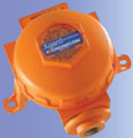
Industry-standard gas detectors