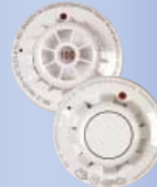
Up to 20 fire/heat detectors per zone