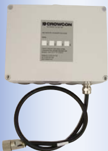
Accessory Enclosure allows connection of mV Bridge type flammable gas detectors.