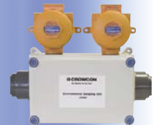
Sampling Device control for Crowcon's Environmental Sampling Unit