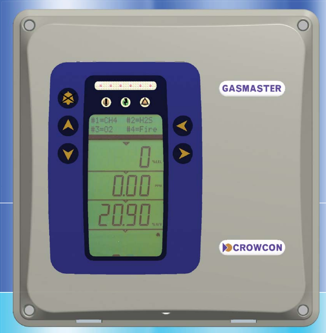
Control panel for gas and fire monitoring