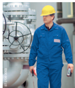
Dräger X-am 3000: All menu functions on one level.