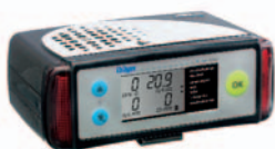
Dräger X-am 3000: Designed for the harshest industrial environments.