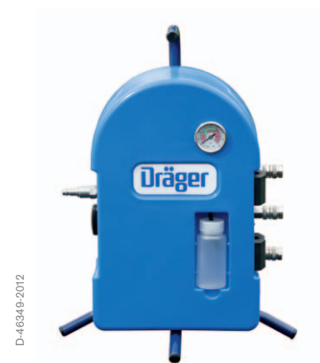
Dräger PAS® Filter - portable