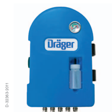
Dräger PAS® Filter - wall-mounted