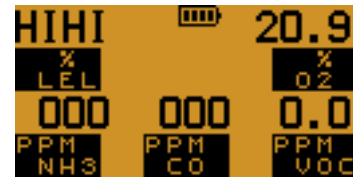
Display in alarm conditions