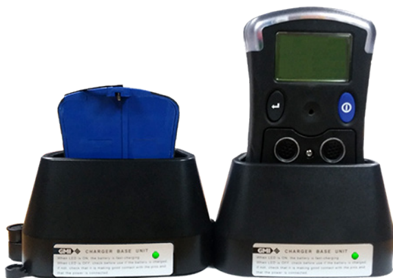
Long duration battery pack & instrument with fast charge battery pack, charging in Fast Charger master / slave units.