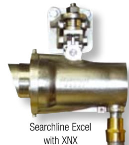
Searchline Excel with XNX