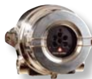
Fire Sentry Series