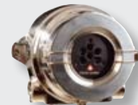
Fire Sentry Series