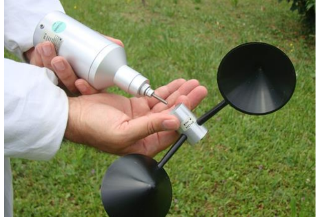
Mount the DNA204 wind rotor on the sensor's body. Keep the shank in a steady position and insert the rotor until it goes to the nut adjustment.