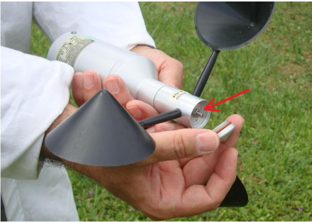
Tighten the screw of the rotor (indicated by the arrow) and the cover. Attention: don't leave the sensor in outdoor operation without its rotor