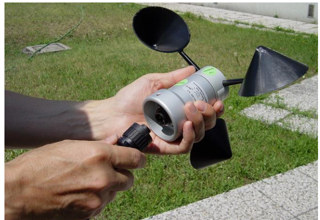
Connect the cable to the sensor.

Fix the cable (n.3 wires) on the connector: screw each wire (indicated by the arrow) on the correspondent connector pin: pins 1, 2 and ground as in the above drawing. Attention to the colour of the wires when connecting the sensor to the data logger.