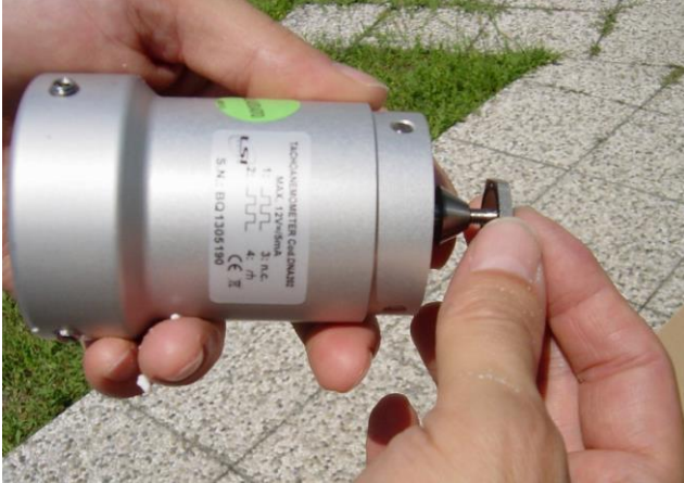
Unscrew the screw from the shaft thread.