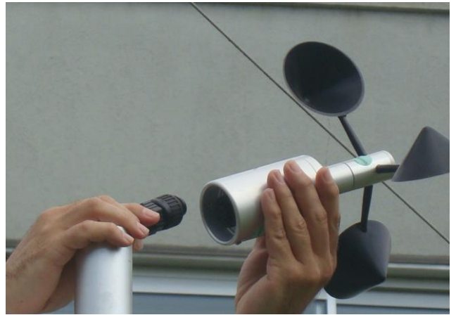
Connect the cable to the sensor.