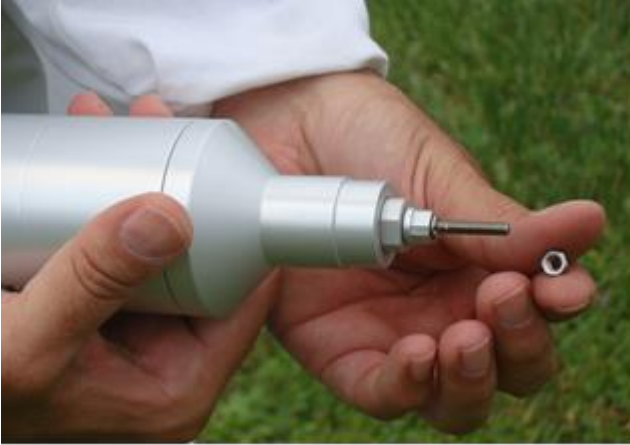
Unscrew the nut and washer from the shaft thread.