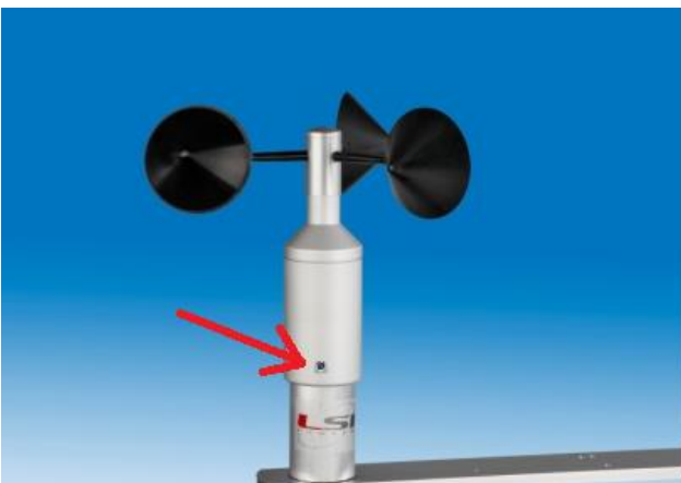
Mount the sensor on the mast and tighten the screw (indicated by the arrow).