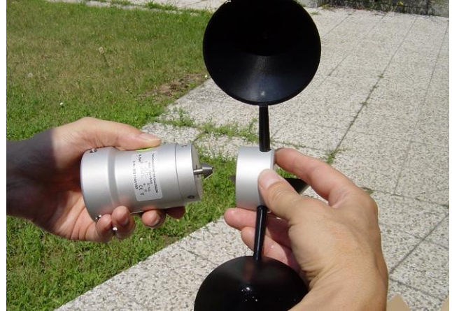
Mount the DNA207 rotor on the sensor's body.