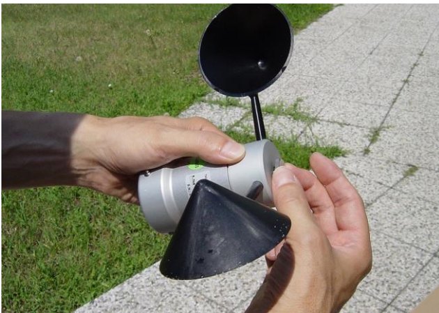
Tighten the screw of the rotor. Attention: don't leave the sensor in outdoor operation without its rotor.