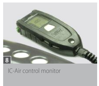
8 IC-Air control monitor