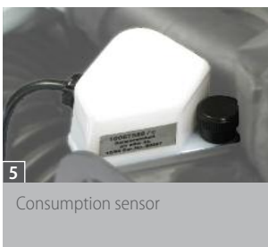
5 Consumption sensor