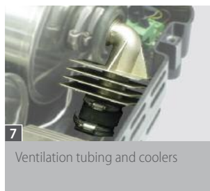
7 Ventilation tubing and coolers