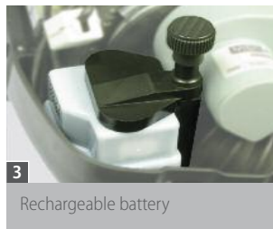
3 Rechargeable battery