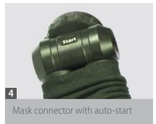
4 Mask connector with auto-start