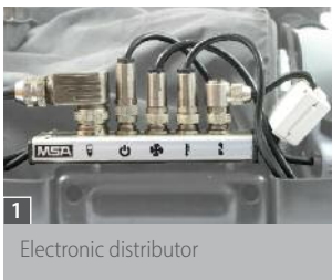
1 Electronic distributor