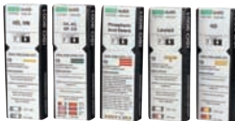
MSA detector tubes for indication of ultra toxic compounds

The highly sensitive detector tubes are designed for evaluation of the potential presence of ultra toxic chemical substances in the air and are resistant to interfering substances. These detector tubes are widely used for special investigation and inspection groups, chemical corps, fire brigades and for use in agricultural research chemical industries and chemical agent incineration plants for the detection of chemical warfare agents, pesticides or reagents for chemical synthesis.