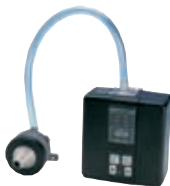
ESCORT ELF 3.5 and Dust Filter Cassette [BIA-Type]

A suitable sorbent tube – depending on type and concentration of the substance to be measured – is connected to the sampling pump “ESCORT ELF” with a sampling device such as the “GEMINI-Twin-Port Sampler”.