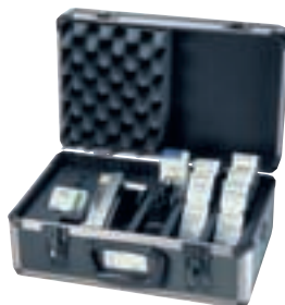
Airtester HP Set with carrying case

In conjunction with Airtester HP [high pressure 200 bar and 300 bar] or Airtester MP [medium pressure up to 10 bar; 145 psi] the HP and MP Detector Tubes are used to monitor the purity of breathing air as supplied from compressors, pressure cylinders or medium pressure air lines.