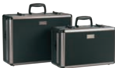
Carrying cases for detector tube and personal protection equipment, portable instruments etc.

The size of the carrying case depends on the desired configuration. Appropriate supply on request.