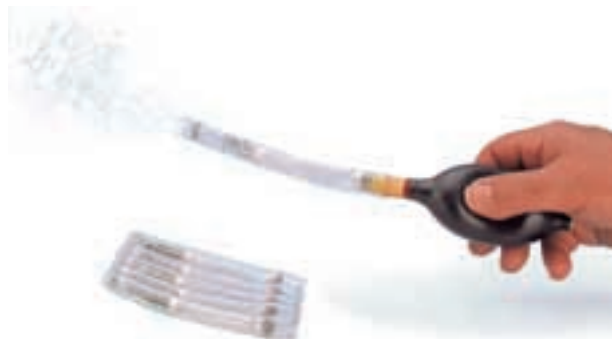
Smoke tube [not corrosive] and rubber aspirator bulb