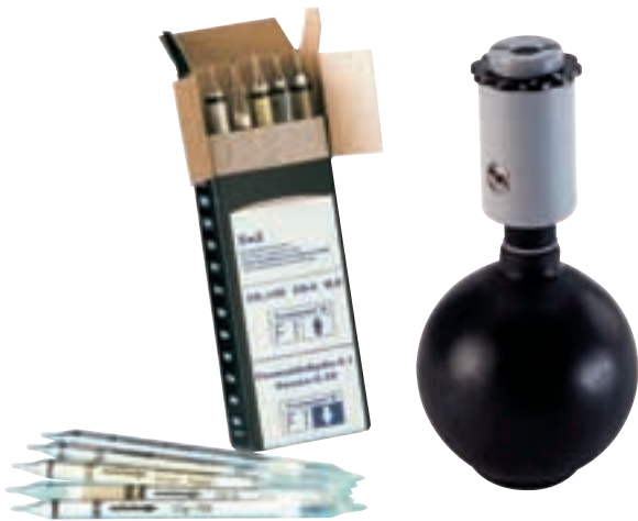
Indoor Air Set with detector tube pump Gas-Tester

The Indoor Air Set provides a quick assessment and a first information of the indoor environment in a wide variety of workplaces offices and other rooms.