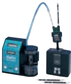
ESCORT ELF and DigiCal