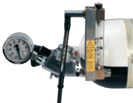
Airtester HP connected to pressure cylinder

[ Monitoring compressed air for breathing apparatus ]