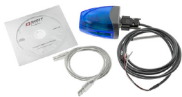
USB/RS-485 Connection Kit

Connect to a PC to adjust detector settings. For use in safe areas only