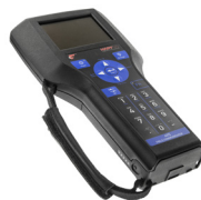
HART® Hand-Held Communicator Kit

Connect to a PC to adjust detector settings. For use in safe areas only