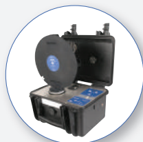
SV 111 Vibration Calibrator