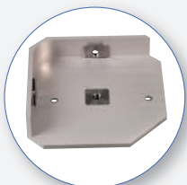
SA 38 Calibration Adapter