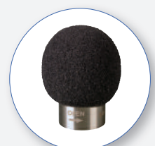
SA 122A Spare Windscreen