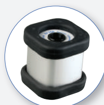
SV 34A Class 2 Acoustic Calibrator