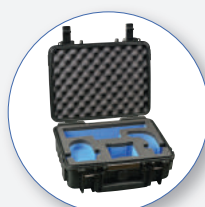
SA 147 Waterproof Carrying Case