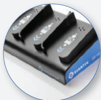
SB 104B-5 Docking Station for 5 Dosimeters