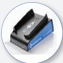
SB 104B-1 Docking Station for Single Dosimeter