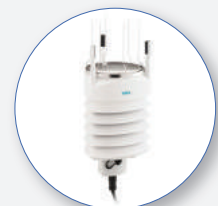
SP 275 Weather Station based on VAISALA module