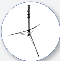
SA 206 Mast for Microphone Protection Kit