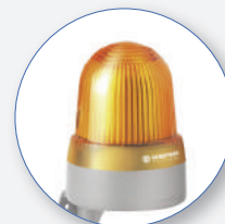
SP 272 Alarm Lamp to Monitoring Station