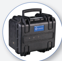
SB 272 External 33 Ah Battery to Monitoring Station