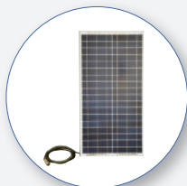
SB 271 Solar Panel to Monitoring Station