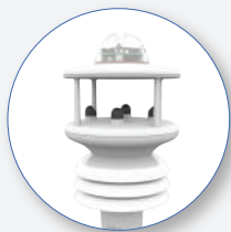
SP 276 Weather Station based on GILL module