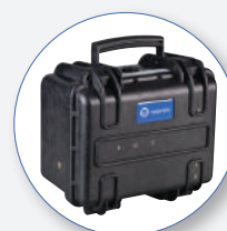
SB 275 External 33 Ah Battery to Monitoring Station