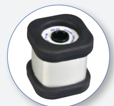
SV 36 Class 1 Acoustic Calibrator 94 dB/114 dB at 1 kHz